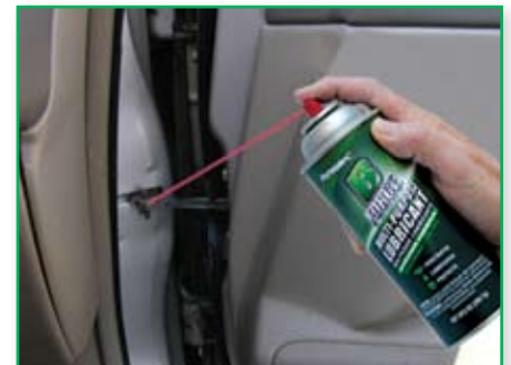
Safe for Home & Auto

Today's consumers want products that help the environment without sacrificing performance, and that's exactly what B FORCE™ delivers.