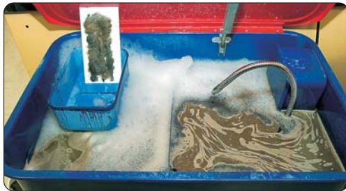
The Leading Green Cleaner Simply can't cut it...

Low Emulsifying – Earth Soap is a low emulsifying formula that allows easier reclamation and recycling when used in conjunction with oil / water separators and other pollution abatement systems.